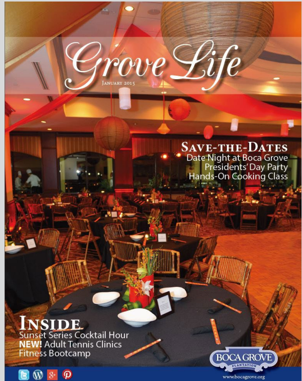
GROVE LIFE NEWSLETTER